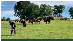
OUR DRIVING RANGE